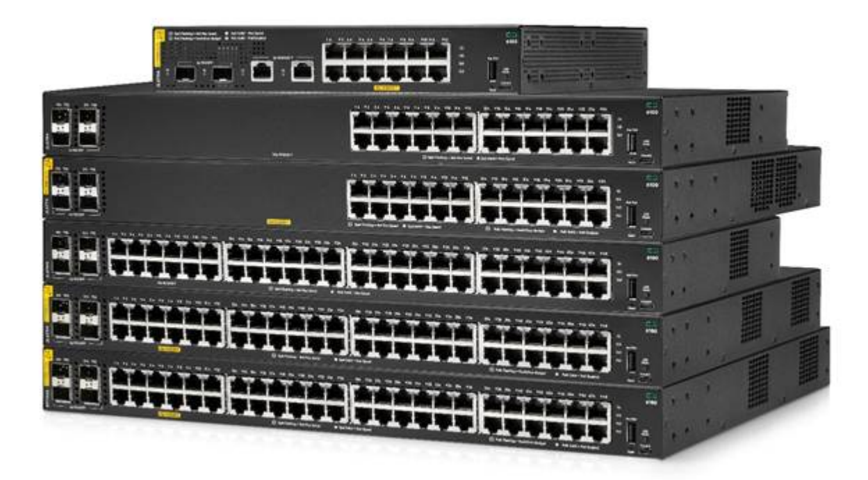
HPE Aruba Networking CX 6100 Switch Series

The HPE Aruba Networking CX 6100 Switch series supports management choices that include Web GUI, CLI, cloud-based and on-premises HPE Aruba Networking Central, so you can choose the best fit for your needs today with flexibility to change without replacing hardware. With enhanced access security, traffic prioritization, and IPv6 support, the HPE Aruba Networking CX 6100 Switch series also simplifies ownership and brings peace of mind with switch software embedded with no subscription required to enable and a Limited Lifetime Warranty.